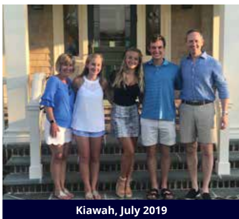
Kiawah, July 2019